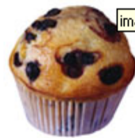
image of small blueberry muffin